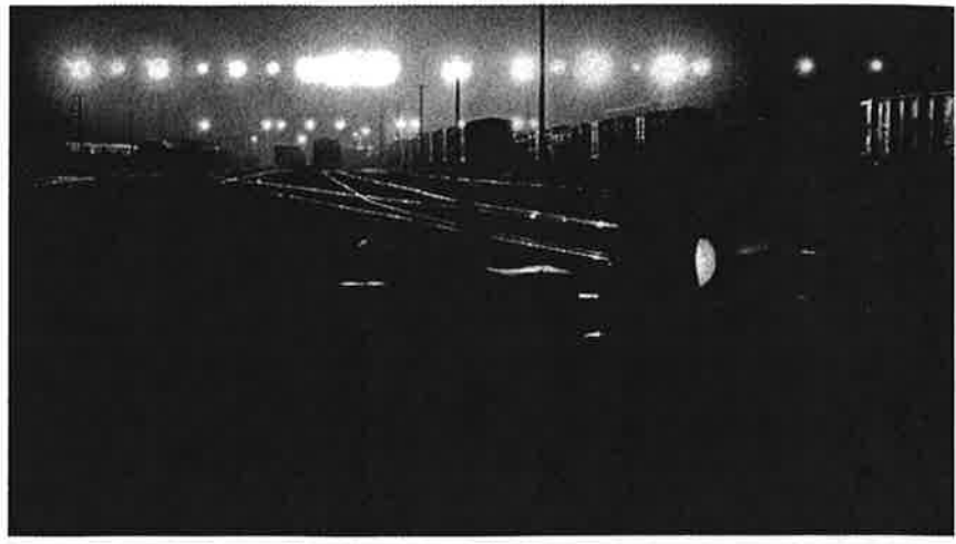
Railways must be careful about how they degrease engine and rolling stock, as witnessed by the Windsor vs. Canadian Pacific Railway Ltd. (CPR) case.

At the federal level, a contaminated site is, "one at which substances occur at concentrations above background levels and pose, or are likely to pose, an immediate or long-term hazard to