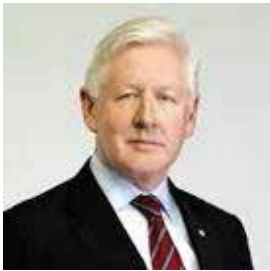
The Hon. Bob Rae

EARLY BIRD DEADLINE: 20 th January, 2014